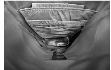
Notebook sleeve for laptops