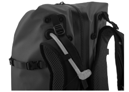
Attachment for hydration system (optional accessory)