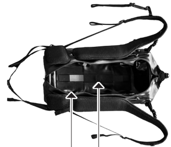
Waterproof hydration tube port (tube not included)